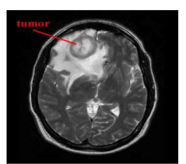
Fig 2.2 An Abnormal Brain MRI Image

MRI is commonly used imaging technique uses magnetic fields and radio waves to produce highquality two or three dimensional images of body, it is a non-aggressive, non-radioactive and pain-free technique for visualizing and detecting the brain tumors without any human involvement. It gives the detailed information regarding normal and abnormal tissue. Accurate brain diagnosis can be done automatically with more accuracy in feature extraction and classification of disease.